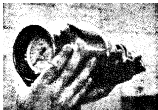
Fig. 1. Calcium carbide gas pressure moisture meter